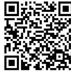
Monday, March 6 th Noon-6 p.m.