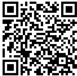
Tuesday, January 3 rd Noon-6 p.m.

There's nothing like Camp Lenape at the YPCC where your child ages 5-12 years old can make new friends, learn and discover, get creative and have fun trying new things in a safe and nurturing environment. Rates are based off of your chosen days and weeks throughout the summer and registration begins on Wednesday, February 1 st .